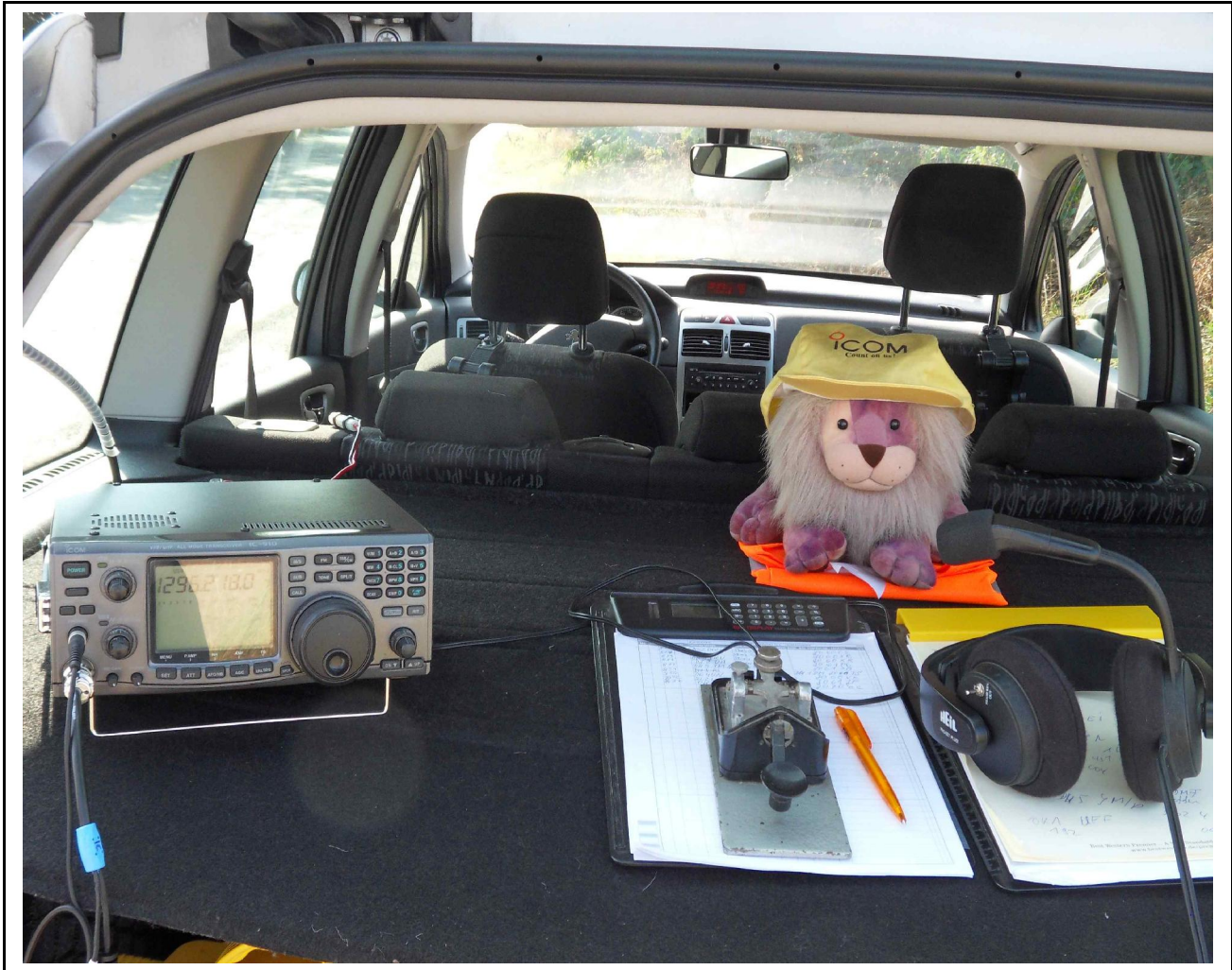
DJ7AL, second Operator ;-)